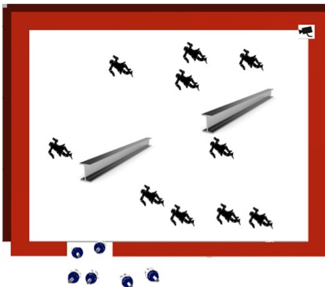
Figure 2. Swarm robots acting in a collapsed building with fallen beams.